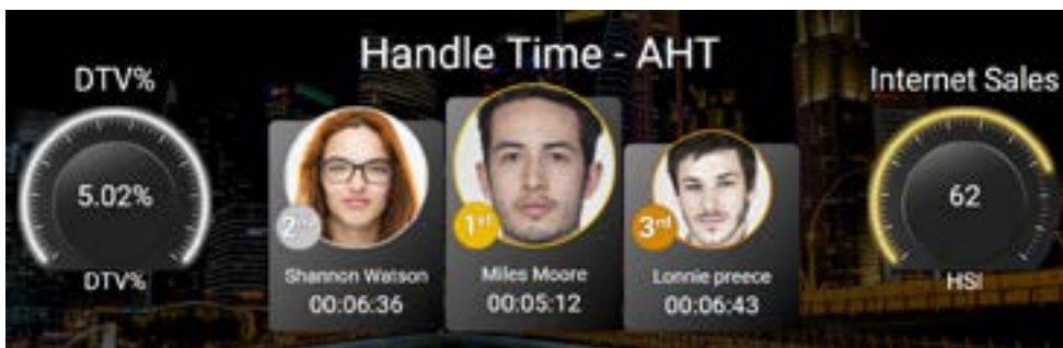
Dynamic, customizable leaderboards create a social, competitive environment